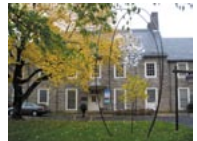
Abington Art Center