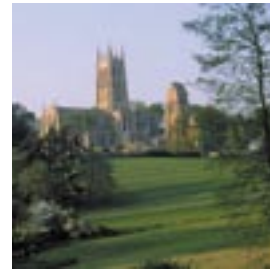
Bryn Athyn Cathedral

Tours of scenic landscapes, art galleries and historic sites in Eastern Montgomery County just North of Philadelphia all within minutes of each other.