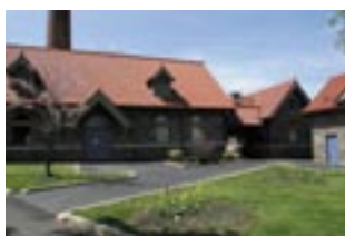
Arcadia University Art Gallery