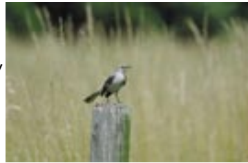
Pennypack Ecological Restoration Trust